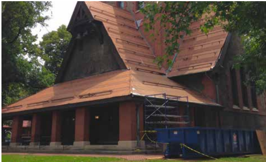
All Souls is getting a new roof! Check back next month for more photos.

Biltmore Village, Asheville, NC 28803 September 2015