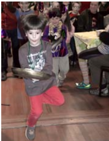
A perfect catch!

Save the dates! Market Place 29 A.D. Monday, June 23 to Thursday, June 26