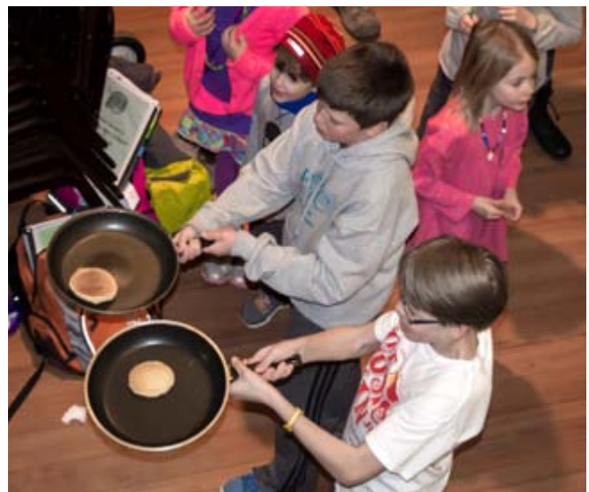
Shrove Tuesday festivities were fun for all.