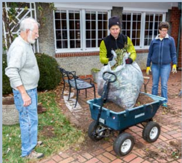
Fall cleanup 2013

A workday has been scheduled for Saturday, April 5, from 9:00 a.m. to noon, to spruce up the church grounds and clean inside the church as we prepare for the Easter season. Outside we’ll be cleaning up the children’s play area and cleaning out the flowerbeds; inside, we need to wash windows, dust, and polish. We welcome and appreciate your help in making the church look fresh and clean as we move into spring. Please join us! If you have questions, please contact Bill Bryant at wmdbryant@gmail.com or by phone at (828) 242-3943.