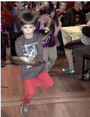
A perfect catch!