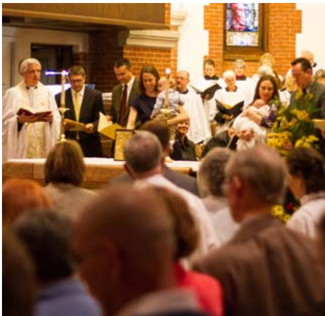
Easter Sunday 2013

* incense will be used at these services